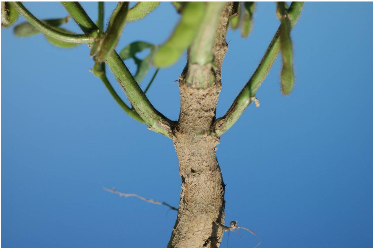
Photo 4. Soybean plant in the R6 or Full Seed stage showing side branches growing from unifoliate leaf nodes (lower two branches visible coming off the main stem) and at a 90 degree angle from the unifoliate leaf nodes is a side branch growing from the first trifoliate node.

By the time full-season on single-cropped plants reach the high numbered V-stages, there can be a question as to how many nodes have been made by the plant. This often occurs in rapidly growing plants especially when initial growing conditions were favorable for rapid germination and growth. In such cases, the identity of the cotyledon nodes, the unifoliate nodes, and the first trifoliate node can be confused. In photo 4 below, note how the two lowest side branches off the main stem highlight the placement of the unifoliate nodes as 90 degrees from the other branches occurring at the trifoliate nodes. The trifoliate leaf nodes occur alternately up the main stem.