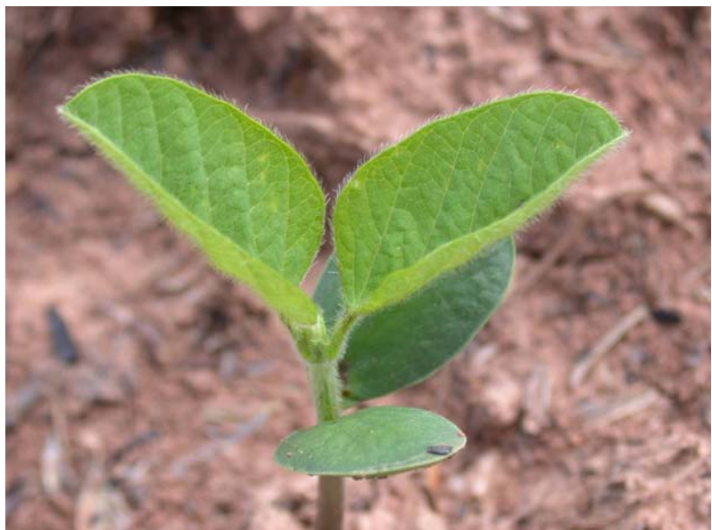
Photo 2. Close-up of soybean plant in the VC or Cotyledon stage since the unifoliate leaves have unrolled sufficiently that the leaf edges do not touch and the next leaf (a trifoliate leaf) has not grown enough that the leaf edges of the three leaflets have unrolled enough to no longer touch (Photo courtesy of R. Taylor).