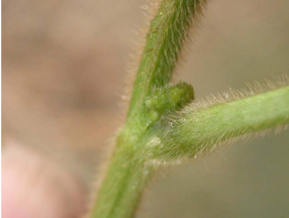
Photo 2. Close-up of leaf axil showing developing flower buds of a soybean plant.

Beginning Bloom or R1 occurs when there is one open flower at any node on the main stem in at least 50% of the plants in the field. Photo 2 shows a view of the flower buds that form in each leaf axil and Photo 3 shows a flower open and in bloom.