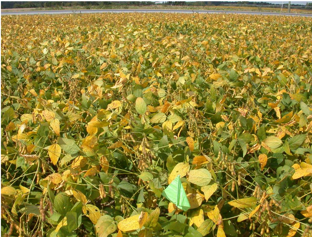
Photo 1. Soybean plants in the R7 or Beginning Maturity stage at which time at least one normal pod that has reached its mature pod color can be found on the main stem of 50% of the plants in the field

The R7 or Beginning Maturity stage is illustrated in Photo 1 below but note that these beans had been sprayed with the fungicide, Headline, at the R3 stage and has resulted in delayed leaf drop. When fungicides have not been used, the soybeans at this stage often have dropped most if not all of their leaves. Limited yield increases will occur once this stage is reached since an increasing number of seed from this point on will have reached their full size and weight. On irrigated beans when soil moisture is adequate, irrigation should cease between the middle of R6 and R7 to allow the soil to begin to dry out for harvest. Stop irrigation at the earlier stage if there is enough moisture in the top and subsoil to carry the beans to maturity. With the price of diesel nearly double that of last year and the low price for soybeans, the earliest possible date for cutting off irrigation could be a more profitable choice this year rather than aiming to capture the maximum possible yield potential from the beans. Aerially seeded cover crops usually are flown on either in late R6 (Full Seed) stage or, where strobilurin fungicides have been used and leaf drop is unusually delayed, at this (R7) stage when about 20% of the leaves have dropped off the plants.