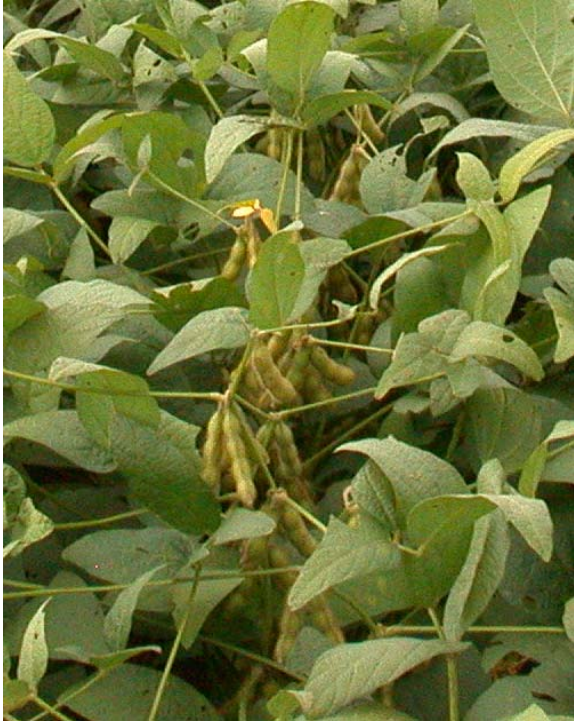
Photo 3. Soybean pods with green seed that fill the pod cavity completely on the uppermost four nodes on the main stem with a fully developed leaf.