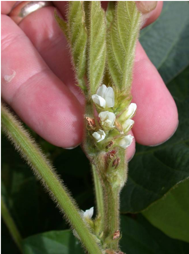
Photo 1. Soybean plants in the R2 or Full Bloom stage at which time blooms have open at one of the two uppermost nodes on the main stem with a fully developed leaf

The R2 or Full Bloom stage is illustrated in Photo 1 below. Full bloom occurs when an open flower occurs at one of the two uppermost nodes on the main stem with a fully developed leaf. At least half the plants in the field must be at this stage for the field to be called in full bloom. Stresses of any type become critical at this and later stages since they can severely limit the number of flowers, pods, or seed set by the crop. When and where possible, stress factors should be eliminated prior to bloom. Maximum yield potential generally occurs if canopy closure occurs ten days to two weeks prior to the bloom stage.