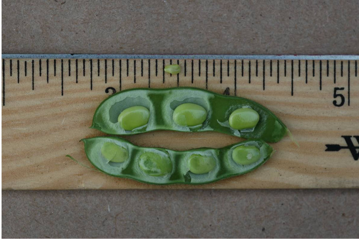
Photo 2. A comparison of seed size between a seed just at the R5 stage and seed in a soybean pod that can be felt and might be thought to have reached R5. Note seed at this later stage is slightly larger than a \frac{1}{4} inch in size versus the \frac{1}{8} th inch for R5.

The R6 or Full Seed stage begins when a pod that contains a green seed that fills the pod cavity occurs at one of the four uppermost nodes on the main stem with a fully developed leaf (Photo 3). Again, one-half of the plants in the field must be at this stage. Often this stage lasts longer than the other reproductive stages and, depending on weather and soil conditions, it can last many weeks. Towards the end of R6, soybean leaves begin to show a bright yellow color that often is accompanied by the shedding of the lowest leaves. Leaf drop follows leaf yellowing as senescence of the crop begins (Photo 4). The next stage (R7) usually occurs when 80 to 90 percent of the leaves have fallen from the plants but when strobilurin fungicides have been applied leaf drop may be delayed past R7.