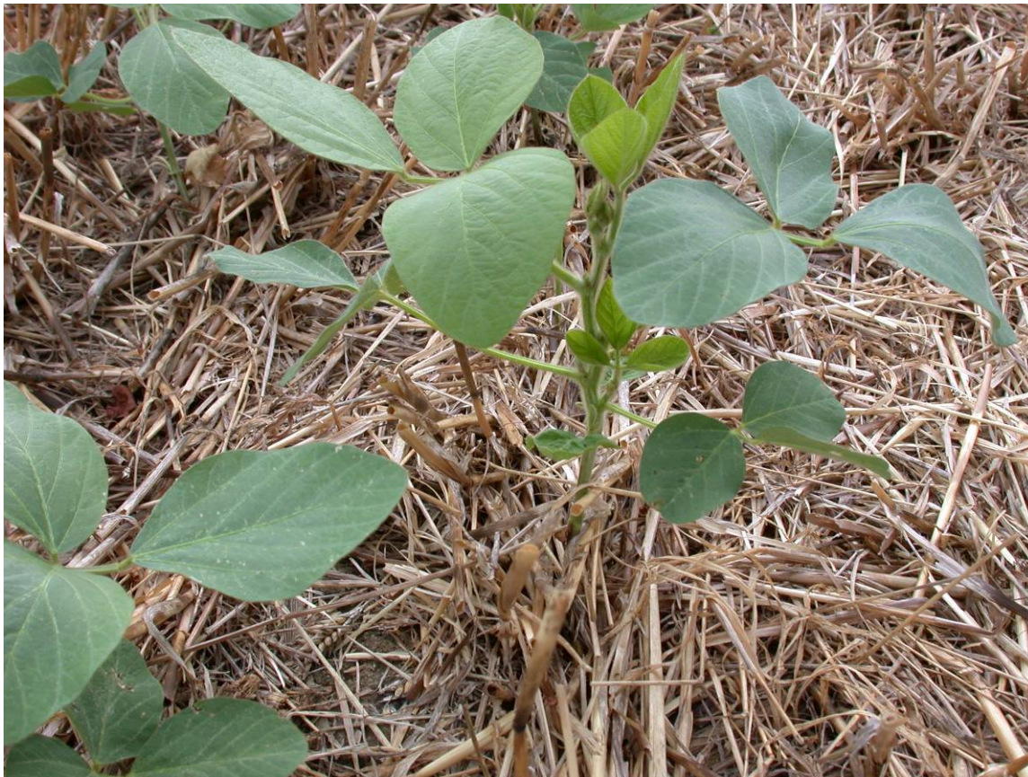
Photo 2. Close-up of soybean plant in the V5 or Fifth Node stage. At this stage a set of unifoliate leaves and four trifoliate leaves are fully developed. The plant is entering a period of rapid growth if adequate moisture, nutrients, and sunlight are available. Note that at low populations the plant is beginning to produce branches and additional trifoliate leaves on the branches. The branch leaves are not counted in the staging of soybeans. Only those leaves that occur on the main stem are counted for staging soybeans.

In late-planted double crop beans, flowering can begin once the plant reaches the V4 stage of growth although in single-crop plantings flowering will not occur until the days shorten to the appropriate day length (actually the night's lengthen to the point at which the variety is triggered to turn reproductive) following the longest day of the year (June 21).