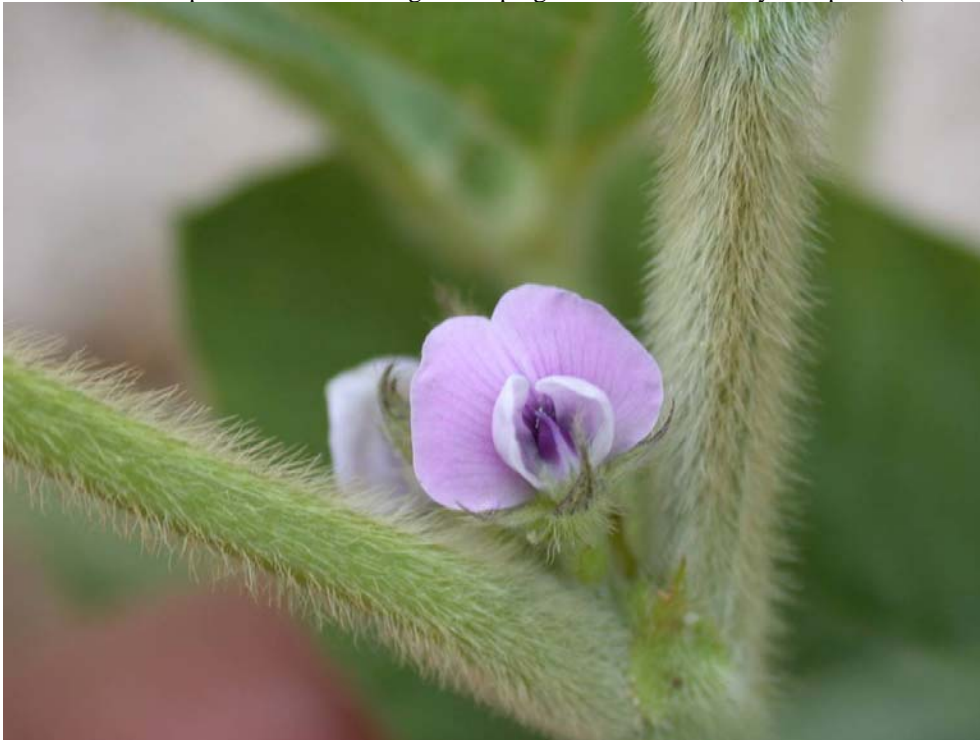
Photo 3. Close-up of leaf axil with open flower on a soybean plant.