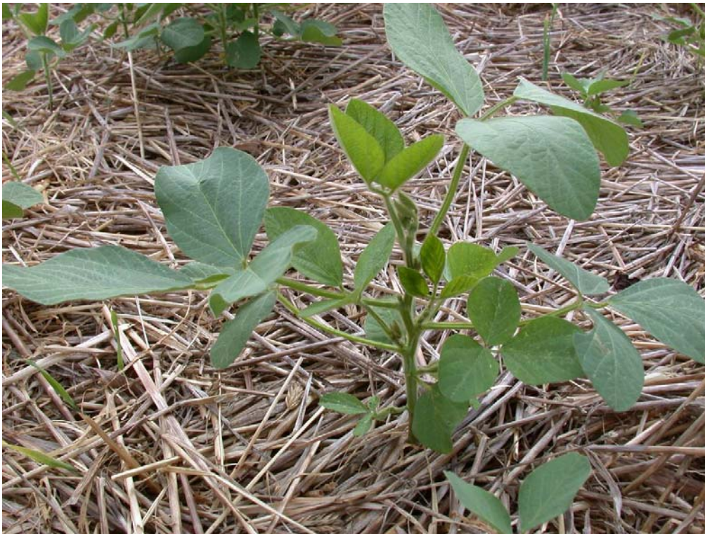
Photo 1. Soybean plants in the V6 or Sixth Node stage at which time the leaflets on the sixth trifoliolate to emerge have unfurled. This means that the fully developed leaves include the unifoliolate leaves and the first to the fifth trifoliolate leaves

To continue soybean growth staging for the V-stages, count the number of nodes on the main stem with fully developed leaves. Remember that a leaf is fully developed when the leaf immediately above it on the main stem has opened so that the leaflet edges have opened or unrolled enough so that the leaflet edges do not touch. The V6 stage is illustrated in Photo 1 below.