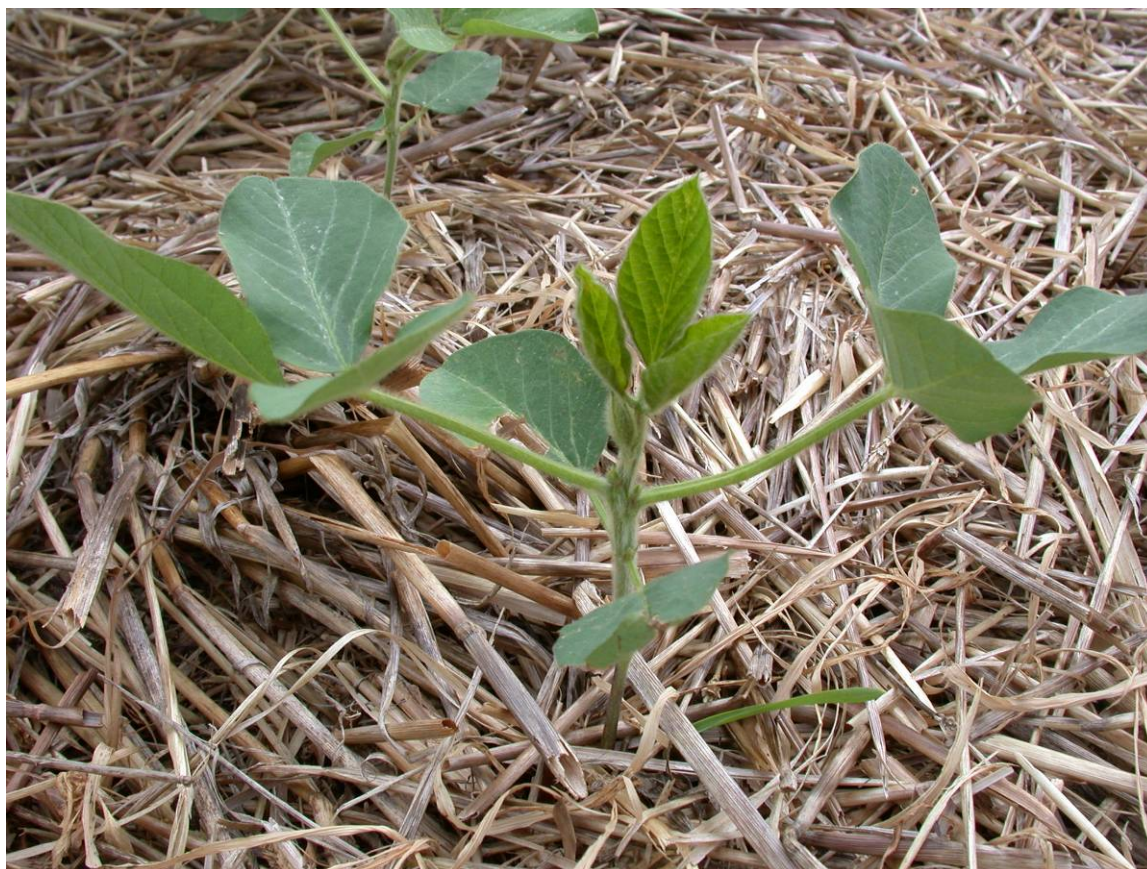
Photo 1. Soybean plants in the V3 or Third Node stage at which time the leaflets on the third trifoliate leaf to emerge have unfurled enough so the leaflet edges no longer touch. This means that the fully developed leaves include the unifoliate leaves and the first and second trifoliate leaves

Continuing the description of soybean growth stages, we move to the ‘Third’, ‘Fourth,’ and ‘Fifth Node’ growth stages. Again, refresh your memory of the definitions covered in the first of this series so you will understand what a fully developed leaf is. V3 begins when the leaflets of the third trifoliate leaf to emerge have unrolled sufficiently that the leaflet edges do not touch (Photo 1 below). The stage continues until V4 or the ‘Fourth Node’ stage when the newly emerged third trifoliate leaf becomes a fully developed leaf (the fourth trifoliate leaf has emerged enough for the leaflet edges to no longer touch). The ‘Fifth Node’ stage occurs when counting from the soil level you have a set of unifoliate leaves (or leaf scars if these leaves have dropped off), and four fully developed trifoliate leaves (Photo 2).