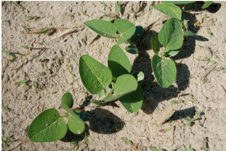
Photo 1. Soybean plants in the VC or Cotyledon stage since the unifoliate leaves have unrolled sufficiently that the leaf edges do not touch and the next leaf (a trifoliate leaf) has not grown enough that the leaf edges of the three leaflets have unrolled enough to no longer touch.

As mentioned in the previous article, I will continue the description of soybean growth stages and illustrate the cotyledon stage with a few photos. You may wish to refresh your memory of the definitions covered earlier but the second stage observed in the field is called VC or the Cotyledon Stage. VC begins when the unifoliate leaves have unrolled sufficiently that the leaf edges do not touch (Photo 1-2 below). The stage continues until V1 or the First Node stage when there are fully developed unifoliate leaves at the unifoliate nodes which indicates that the first trifoliate leaves have unrolled sufficiently that the leaf edges do not touch.