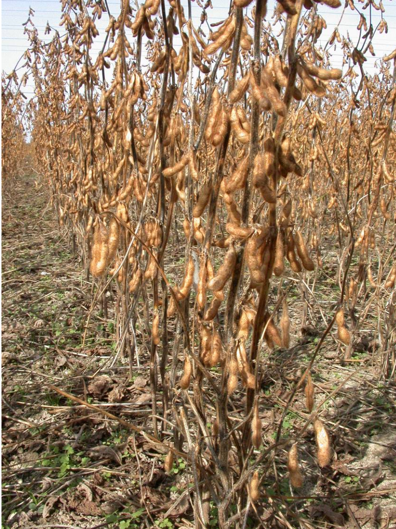
Photo 2. Soybean plants in the R8 or Full Maturity stage at which time 95% of the pods have reached their maturity pod color

Full maturity occurs when 95% of the pods have reached their mature pod color (Photo 2). At full maturity, there is no longer an increase in yield due to seed fill since the abscission layer has formed cutting the beans off from the rest of the plant. From this point on, the process is essentially a matter of the seeds losing enough moisture to reach the point when they can be safely harvested, dried, or stored.