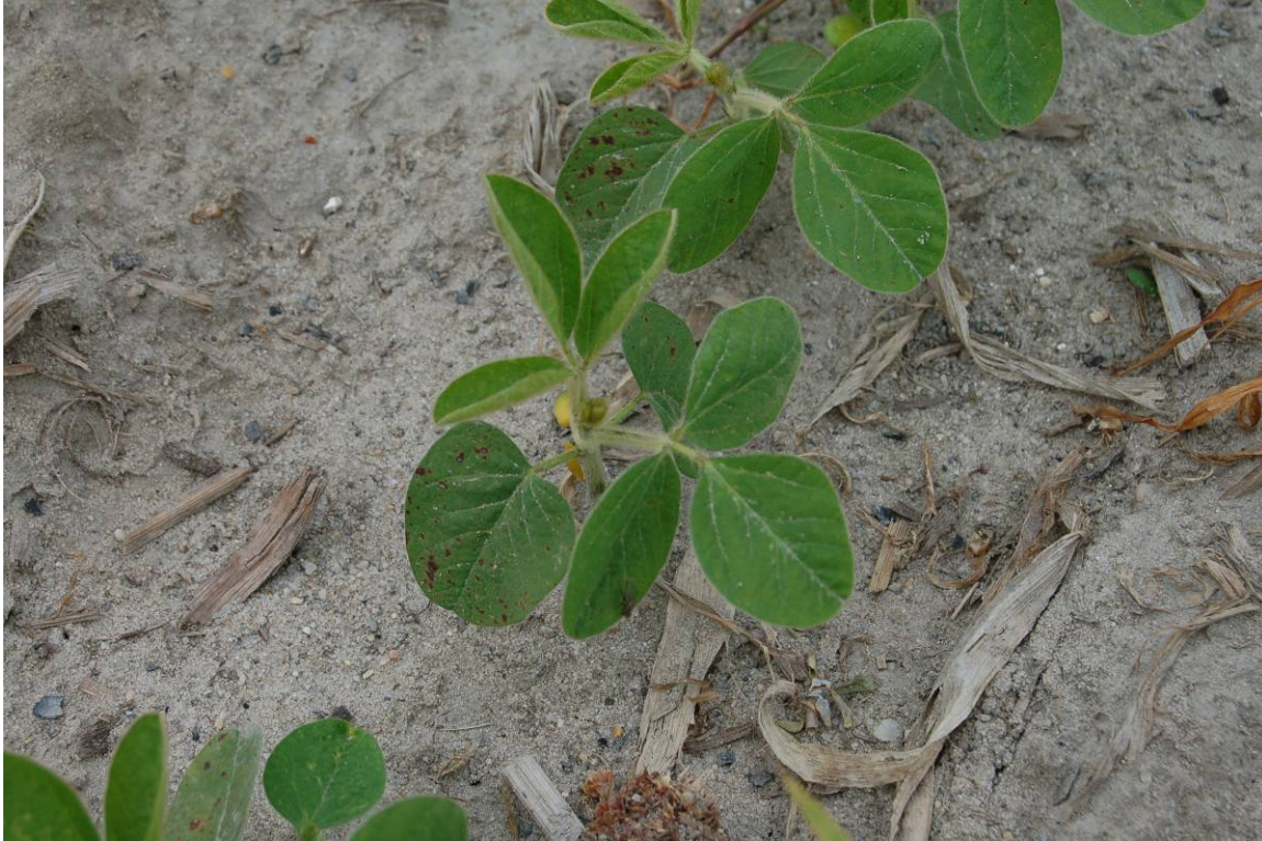
Photo 2. Close-up of soybean plant in the early V2 or Second Node stage. At this stage both the unifoliate and the first trifoliate leaves are fully developed. The plant is entering a period when enough leaf area is present that if adequate moisture, nutrients, and sunlight are available that growth will become very rapid (Photo courtesy of Cory Whaley).

application of glyphosate but there are some precautions to follow to prevent Mn from interfering with weed control. Tests have shown EDTA Mn to be safe when mixed with Roundup sprays but other Mn products can reduce weed control if not handled properly. Always add ammonium sulfate at a rate of 1 to 2 percent by weight or 8.5 to 17 pounds per 100 gallons before either adding the glyphosate or techmangam. This will prevent the Mn products from binding to glyphosate and reducing its performance.