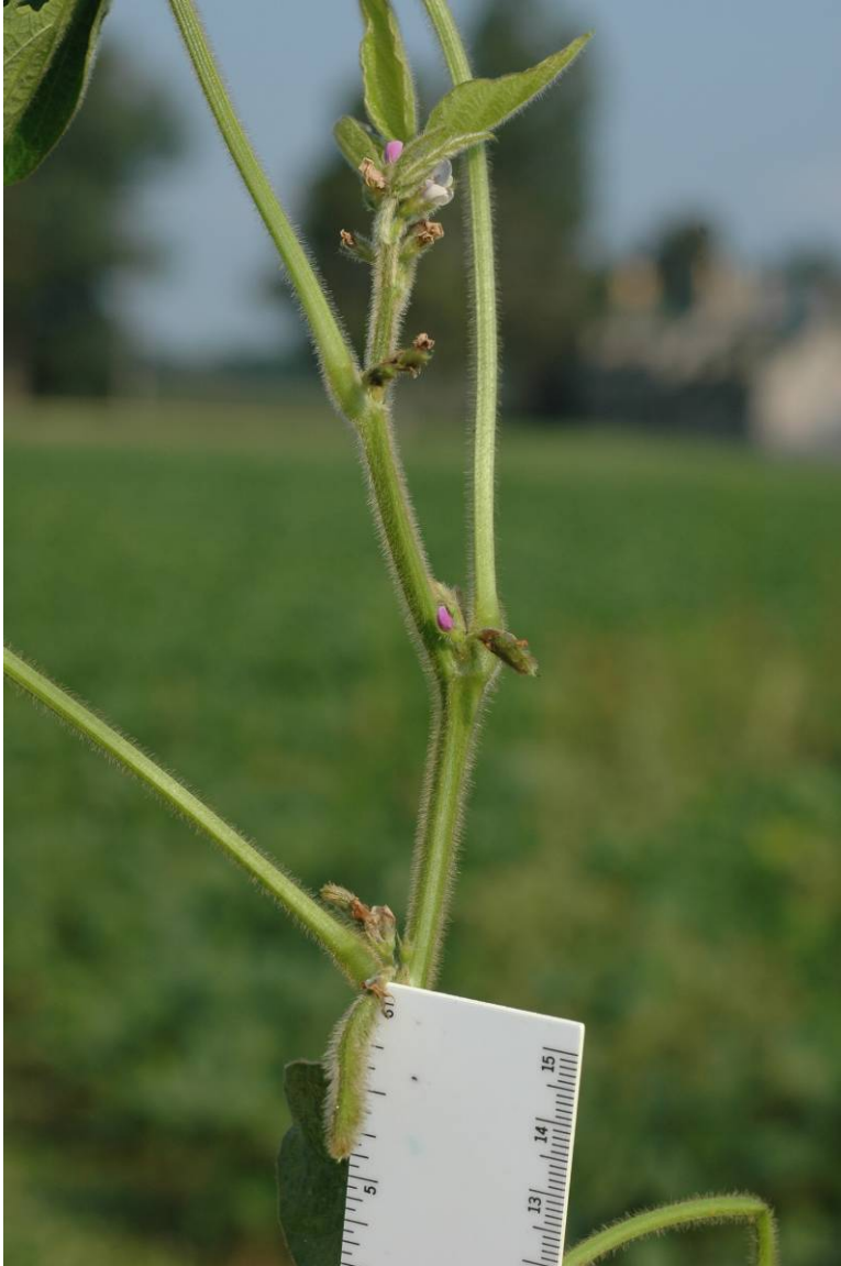
Photo 3. Soybean plant in the R4 or Full Pod stage at which time a pod 3/4 of an inch long (about 19 mm) has formed at one of the four uppermost nodes on the main stem with a fully developed leaf

Frequently, fungicide applications for soybean health and yield enhancement are applied at either the R3 or R4 growth stage. Yield response to this type of fungicide application usually averages from 3 to 6 bu/A; but, in demonstration and research trials across the country, the range has been from yield loss to large yield increases depending on the individual situation. In these trials, the frequency of yield responses and the actual yield responses suggests that this type of application under good growing conditions can usually return enough to cover the costs involved. In trials in this region, we have found about a 3 to 5 bu/A increase in each of the trials we've conducted. A possible downside has been a delay in maturity and increase in the number of green stems on beans at the time they reach harvest moisture. Although the fungicide applications should help soybean health at harvest, this factor was improved in only one of the three site-years in our studies.