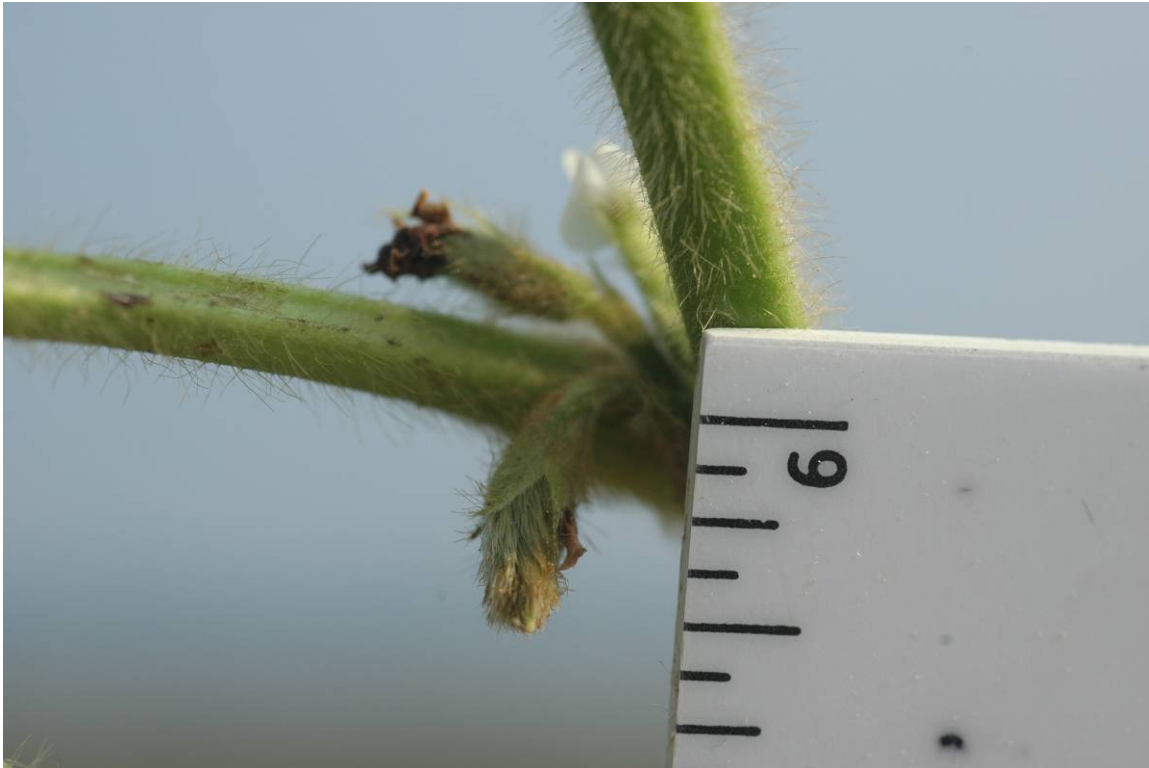
Photo 1. Soybean pod about \frac{3}{16} of an inch long (about 5 mm) at one of the four uppermost nodes on the main stem with a fully developed leaf looks very small.

The R3 or Beginning Pod stage is illustrated in Photo 1 below. Beginning Pod occurs when a pod \frac{3}{16} of an inch (about 5 mm) has formed at one of the four uppermost nodes on the main stem with a fully developed leaf. At least half the plants in the field must be this stage for the field to be called in the Beginning Pod stage. Drought and other stresses at this stage can cause pod abortion or lead to pods with fewer seeds per pod that would have occurred with the stress. Some flowers are still blooming and can replace dropped pods if the stress causing pod drop is eliminated.