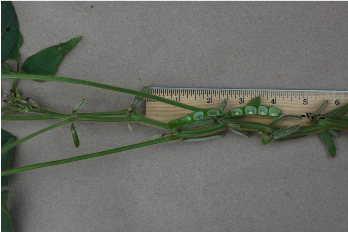
Photo 1. Soybean pods with seed that is \frac{1}{8} th of an inch (about 3 mm) long at one of the four uppermost nodes on the main stem with a fully developed leaf is considered at the R5 or Beginning Pod stage.

The R5 or Beginning Seed stage occurs when on 50% or more of the plants in a field you can find a seed \frac{1}{8} of an inch long (just slightly greater than 3 mm) in a pod at one of the four uppermost nodes on the main stem with a fully developed leaf (Photo 1). This occurs in pods earlier than we often think (Photo 2) as pods may be only an inch long. The tendency for most of us is to wait to call a plant in the R5 stage when we can either easily see the seed developing in the pod or can easily feel the seed in the pod. Usually by this point, the seed has grown to about a \frac{1}{4} inch in length.