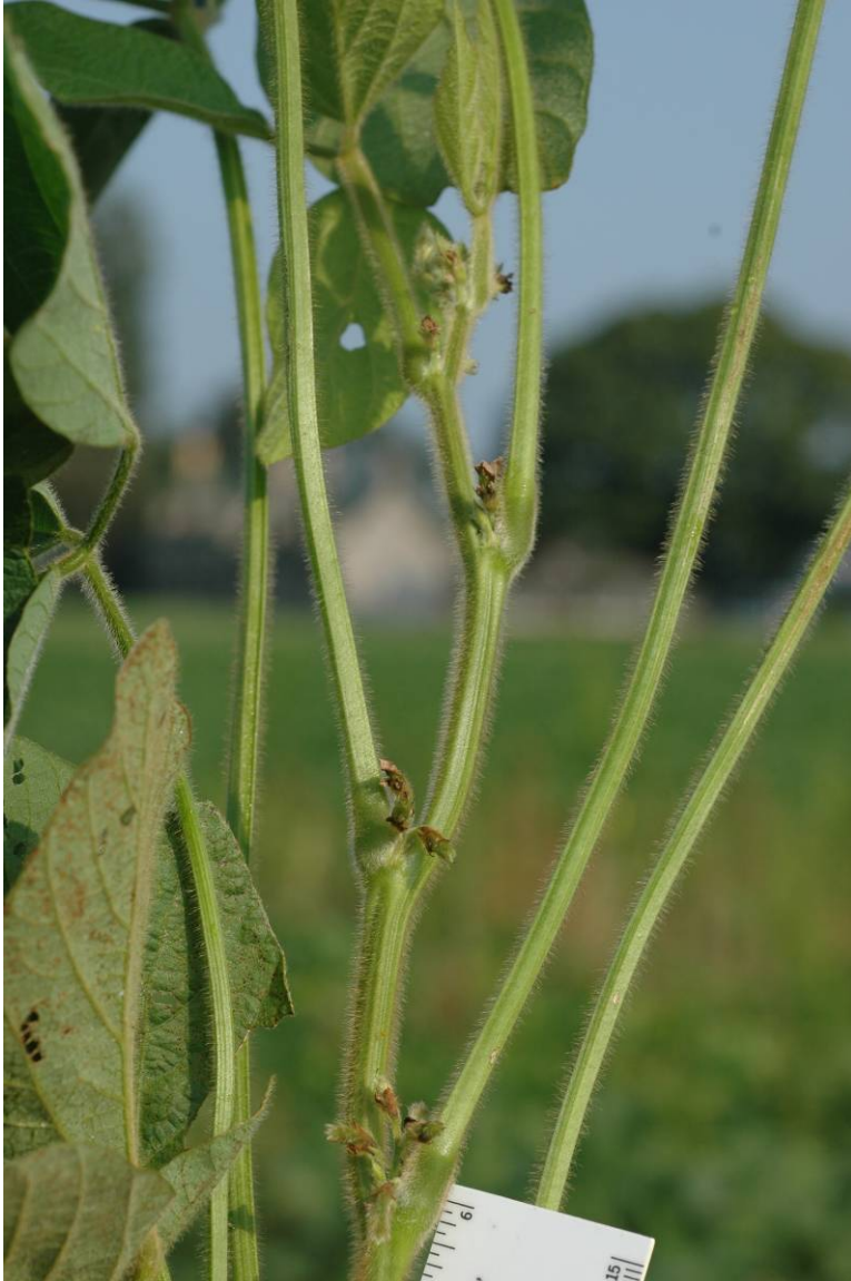
Photo 2. Soybean plant in the R3 or Beginning Pod stage at which time a pod \frac{3}{16} of an inch long (about 5 mm) has formed at one of the four uppermost nodes on the main stem with a fully developed leaf

The Full Pod stage (R4) occurs when half the plants in the field have a pod \frac{3}{4} of an inch long (about 19 mm long) at one of the four uppermost nodes on the main stem with a fully developed leaf. Flowering is about complete at this stage so stresses that cause serious pod drop and potential yield loss are unlikely to be made up other than by an increase in average seed size if the stress is removed. This limits the potential for yield recovery from stress conditions at this and later growth stages.