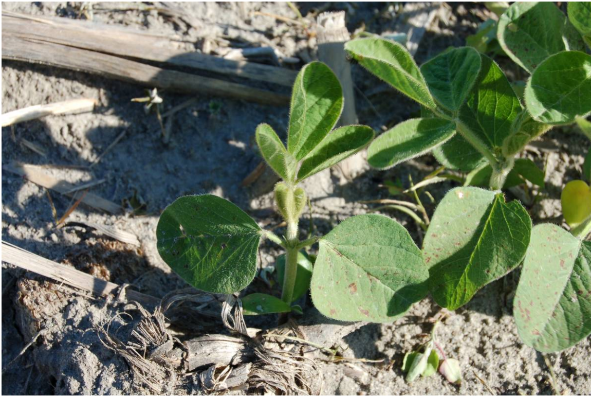
Photo 1. Soybean plants in the V1 or First Node stage at which time the leaflets on the first trifoliolate leaf to emerge have unfurled enough so the leaflet edges no longer touch. This means that the unifoliate leaves are now fully developed leaves.

To continue the description of soybean growth stages, we now move on to the ‘First Node’ growth stage. Again, you should refresh your memory of the definitions covered in the first of this series so you will understand what a fully developed leaf is. V1 begins when the leaflets of the first trifoliolate leaf to emerge have unrolled sufficiently that the leaflet edges do not touch (Photo 1 below). The stage continues until V2 or the ‘Second Node’ stage when the first trifoliolate leaf becomes a fully developed leaf (Photo 2).