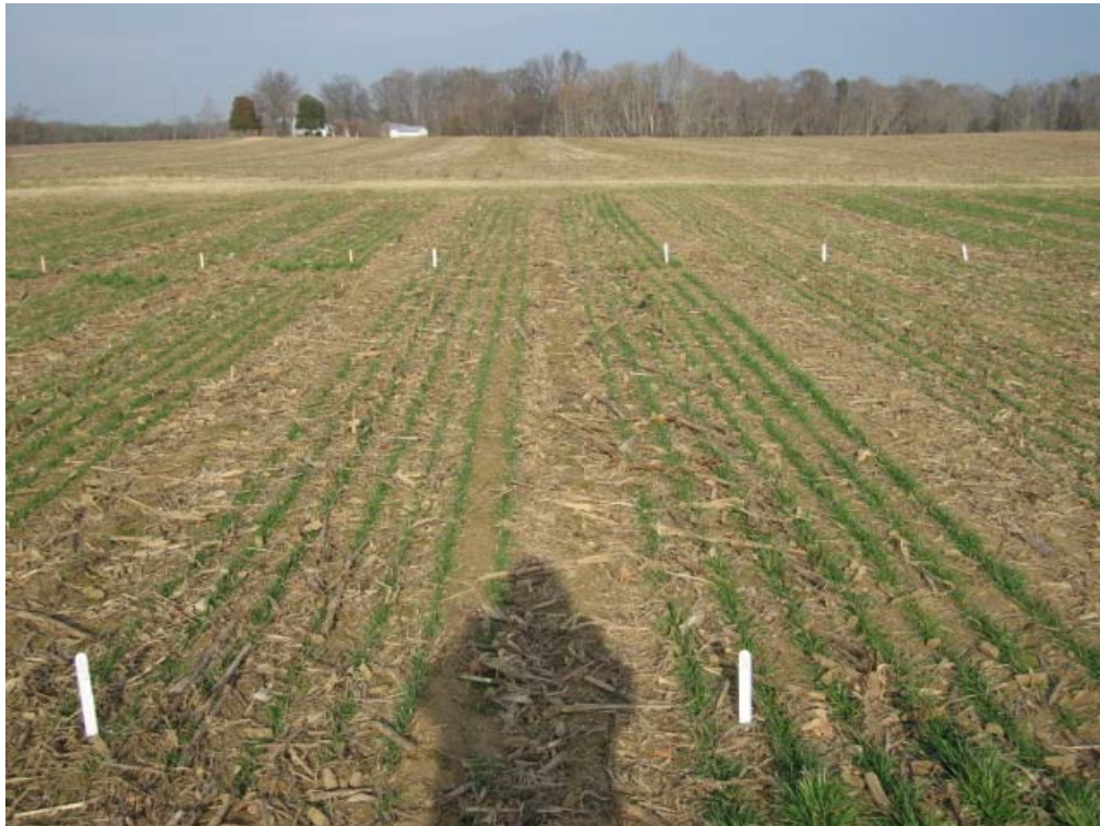
Early season wheat growth with deficient (left) and adequate (right) preplant nitrogen.